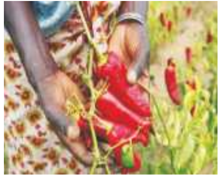
Capsicum annum L (Paprika)