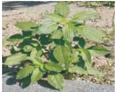
Amaranthus lividus (Bonongwe)