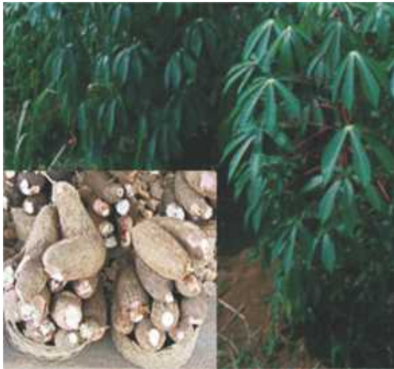
Manihot esculenta Crantz (Cassava) Plants, with tubers (inset)